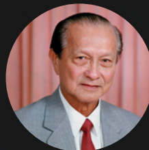
Wee Kim Wee

Editorial Manager, The Straits Times (Founding Pioneer, Singapore Press Club)